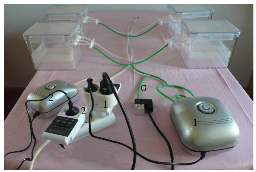
Figure 2. The end of the tube from the middle filter of the first bioreactor is connected to a 10W pump (1) and an electronic valve (G) using two 3-way connectors. Both the pump and the electronic valve is then inserted into a 2-way splitter socket attached to a timer (1). The end of the tube from the outer filter of the first bioreactor is connected to a 5W pump (2) using a 3-way connector and then attached to timer (2). Both timers are then inserted to an extension lead.